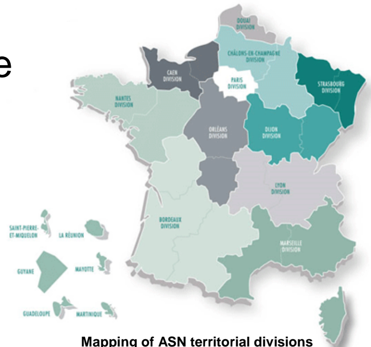
Mapping of ASN territorial divisions