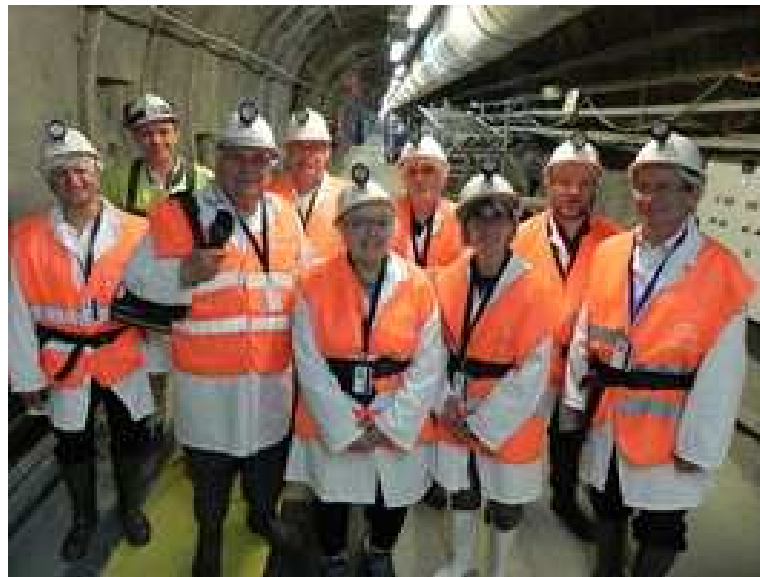
HCTISN delegation visiting the laboratory of Bure

“The High Committee for Transparency and Information on Nuclear Security is an information, and debate body on the risks related to nuclear activities and the impact of these activities on personal health, on environment and on nuclear security.”