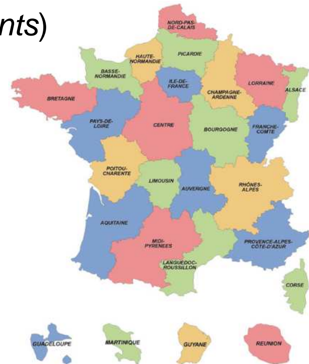
Mapping of French regions