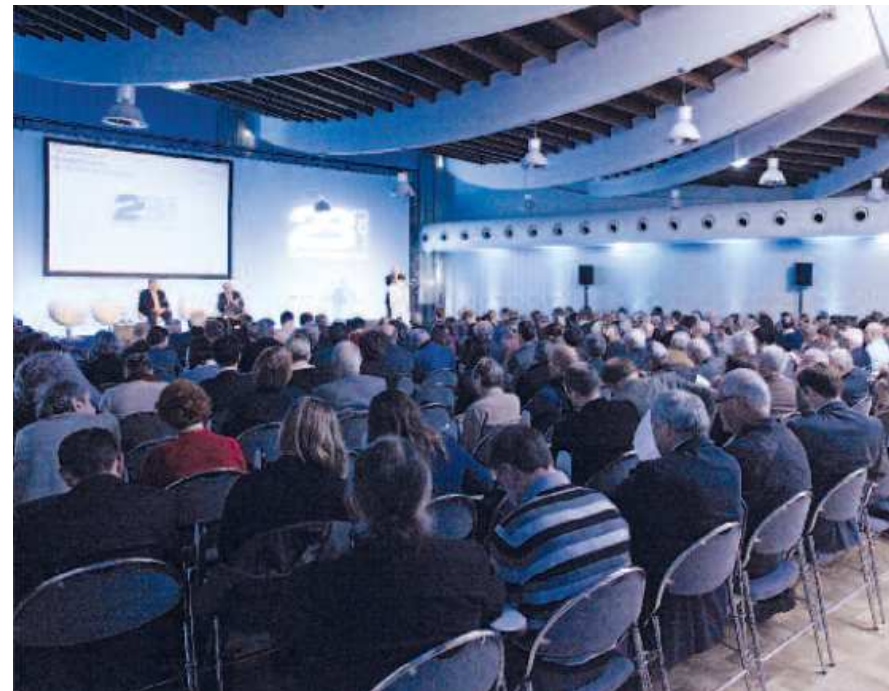
23 rd CLI conference

“(...) a local information committee is (...) tasked with a general follow-up, information and consultation mission in the field of nuclear safety, radioprotection and the impact of nuclear activities on persons and the environment as far as the site installations are concerned.”