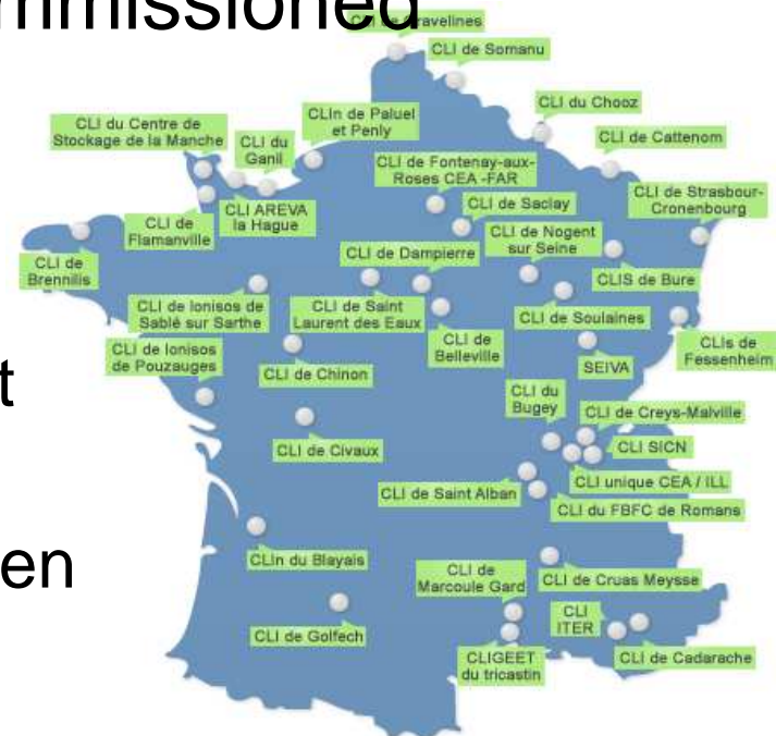
CLI for each nuclear installation